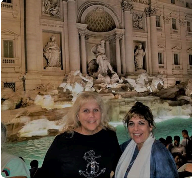
Trevi Fountain Rome